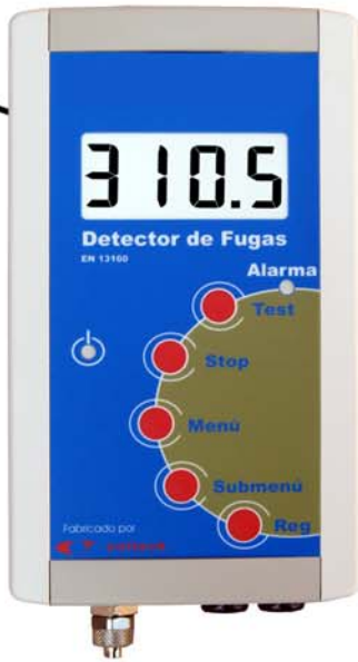
Exterior View Front Face